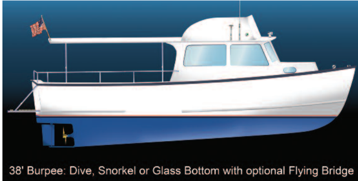
38' Burpee: Dive, Snorkel or Glass Bottom with optional Flying Bridge